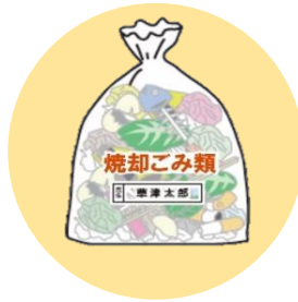
New (Orange printing)