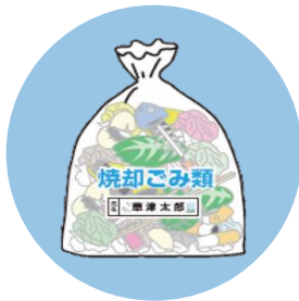
Current (Blue printing)